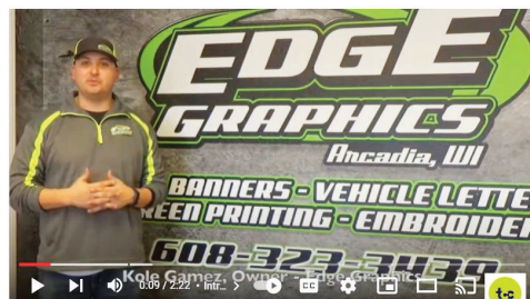
TCC Business Spotlight: Edge Graphics

OUR OFFICES WILL BE CLOSED ON MONDAY, SEPTEMBER 4TH FOR LABOR DAY.