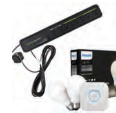
Phillips Hue Starter Kit & Emberstrip Kit (FREE)