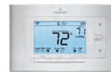
Emerson Sensi Wi-Fi Thermostat (FREE)

TCC Internet customers whose electric or gas company is in the Focus on Energy program can get one energy saving device from Focus on Energy for FREE or at a reduced price! Available items are listed below. You can get a list of participating electric and gas companies online at: focusonenergy.com/utilities . Devices are then ordered online through Focus On Energy. TCC does not offer free installation or support these devices offered through this program.