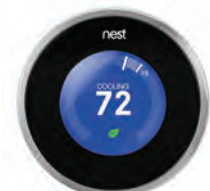
Nest Learning Thermostat ($120 co-pay)

To get started, just contact TCC. We'll give you a code to use at the Focus on Energy connected devices program website to order the energy saving device you want!