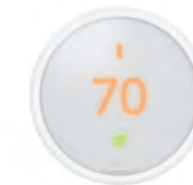
Nest Thermostat E (FREE)