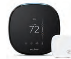
Ecobee3 Smart Thermostat ($120 co-pay)